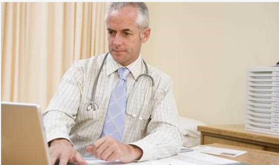
HemorrhoidsSitz Bath HemorrhoidsHemorrhoid