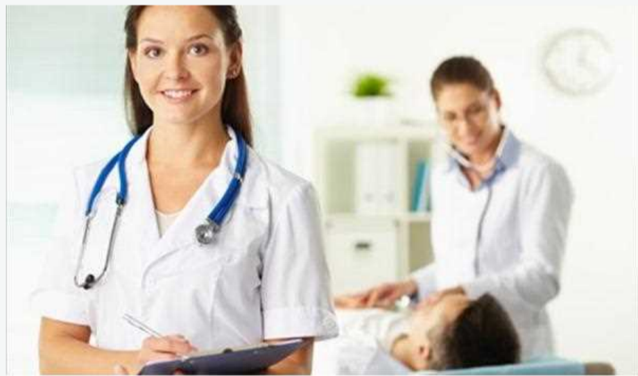
Hemorrhoids Hemorrhoid Piles Internal Hemorrhoids