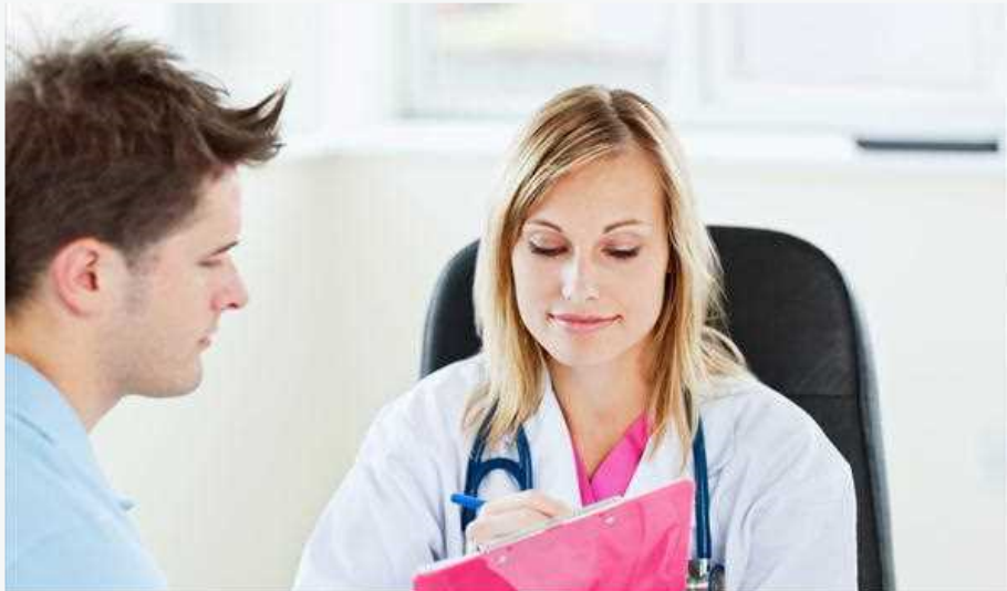
HemorrhoidsHemorrhoidExternal HemorrhoidsExternal HemorrhoidThrombosed