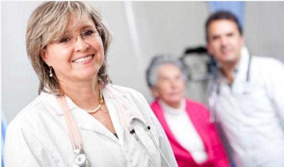
HemorrhoidsHemorrhoidHemorrhoid ReliefExternal HemorrhoidsPiles