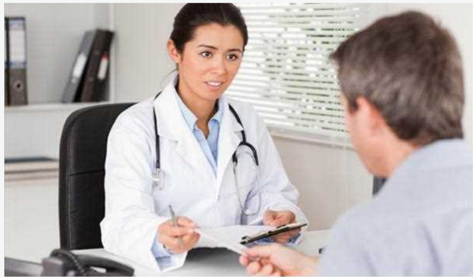
HemorrhoidsHemorrhoidExternal HemorrhoidsInternal HemorrhoidsPiles

Bleeding piles are a sign of very swollen hemorrhoids that will need to be treated quickly to stop the situation from getting any worse. Learn about natural homeopathic remedies as alternatives to your regular over the counter products that only give temporary relief.